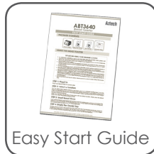
Easy Start Guide